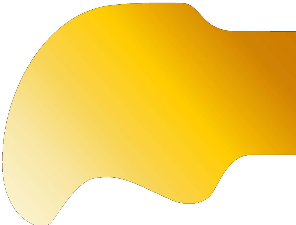
Teil F-2 links